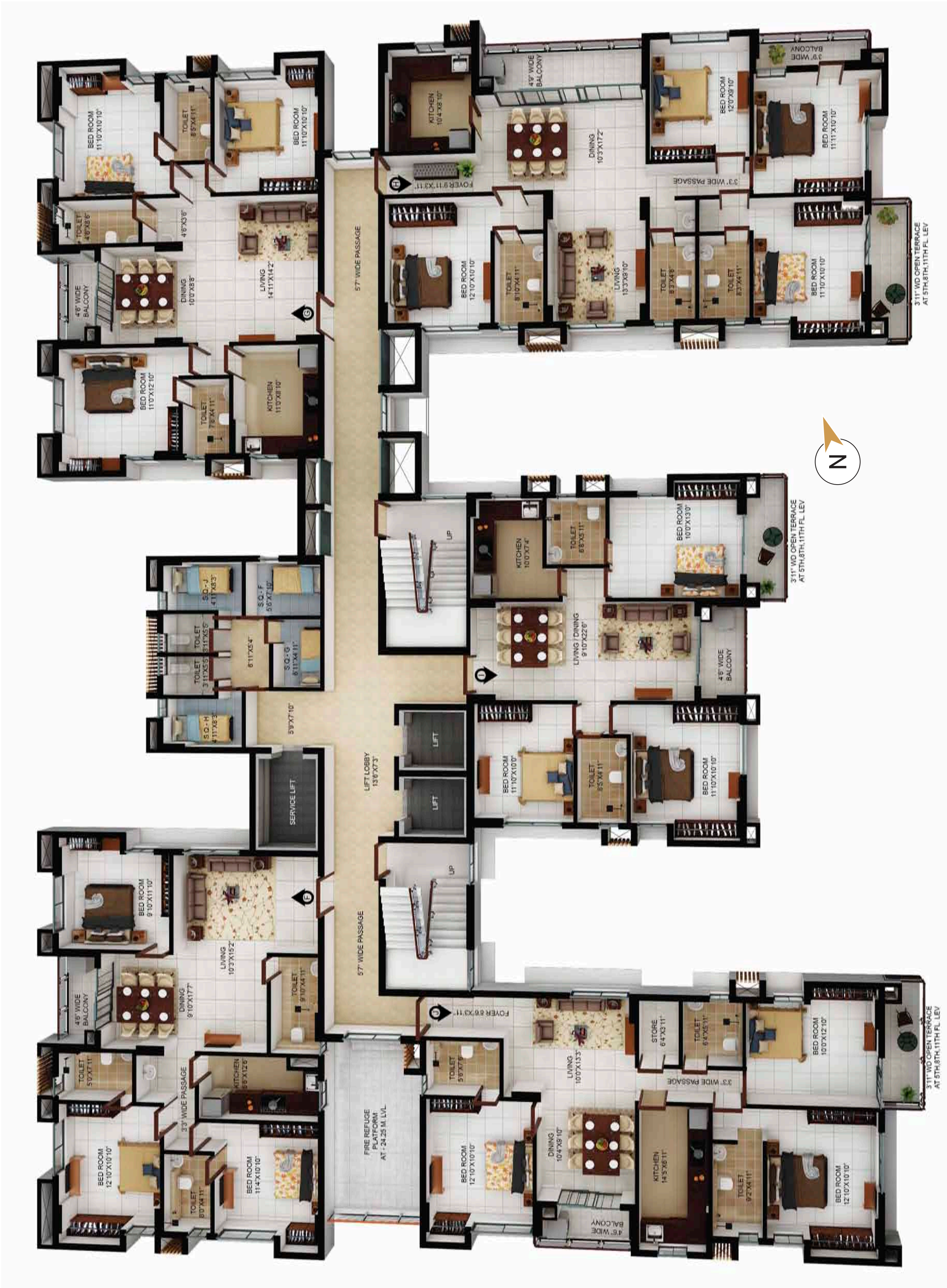
Tower-2 | Typical floor plan 5th, 8th & 11th floor (Area as per WBHIRA)