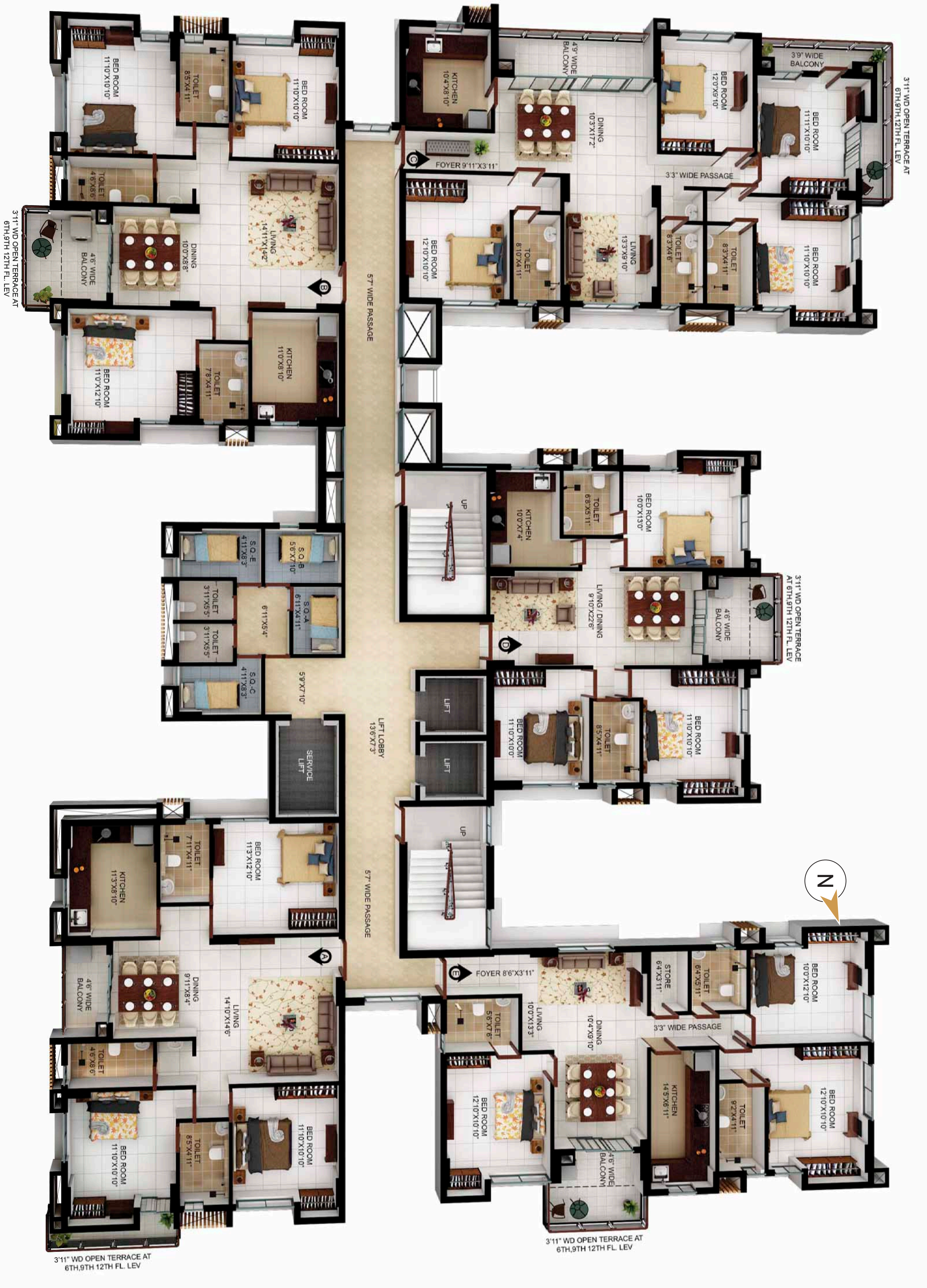
Tower-1 | Typical floor plan 6th, 9th & 12th floor (Area as per WBHIRA)