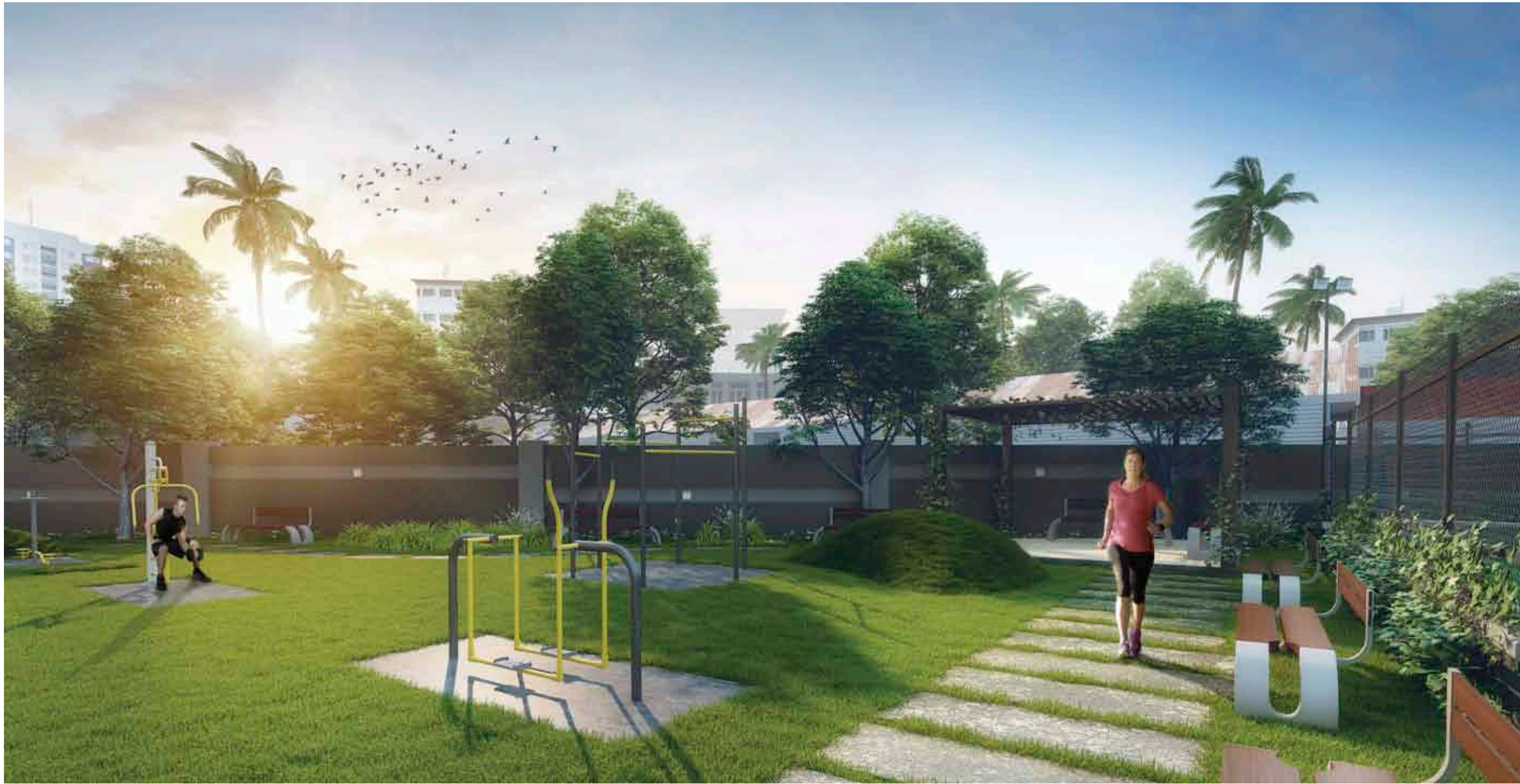
Outdoor fitness zone