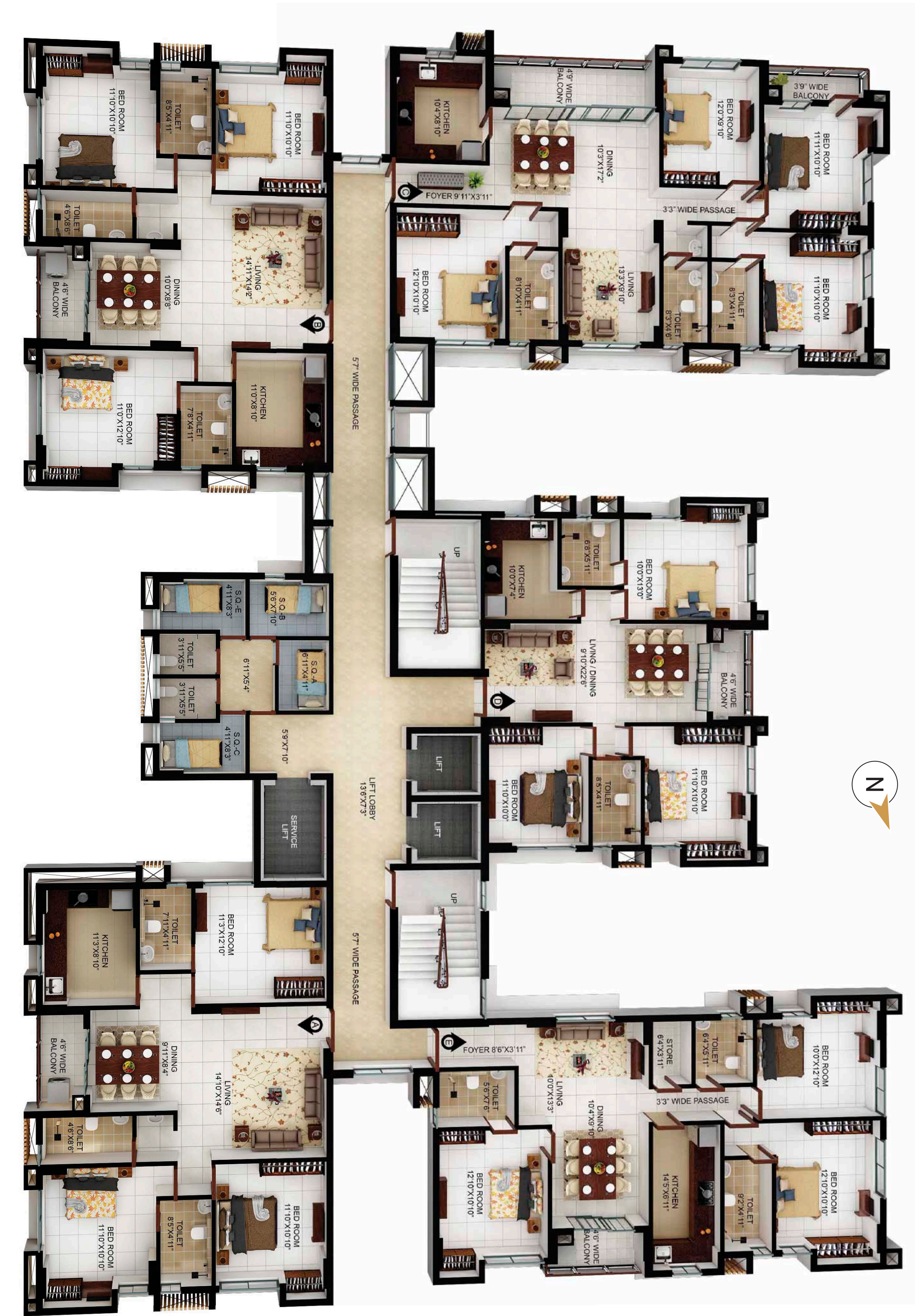
Tower-1 | 3rd floor plan (Area as per WBHIRA)