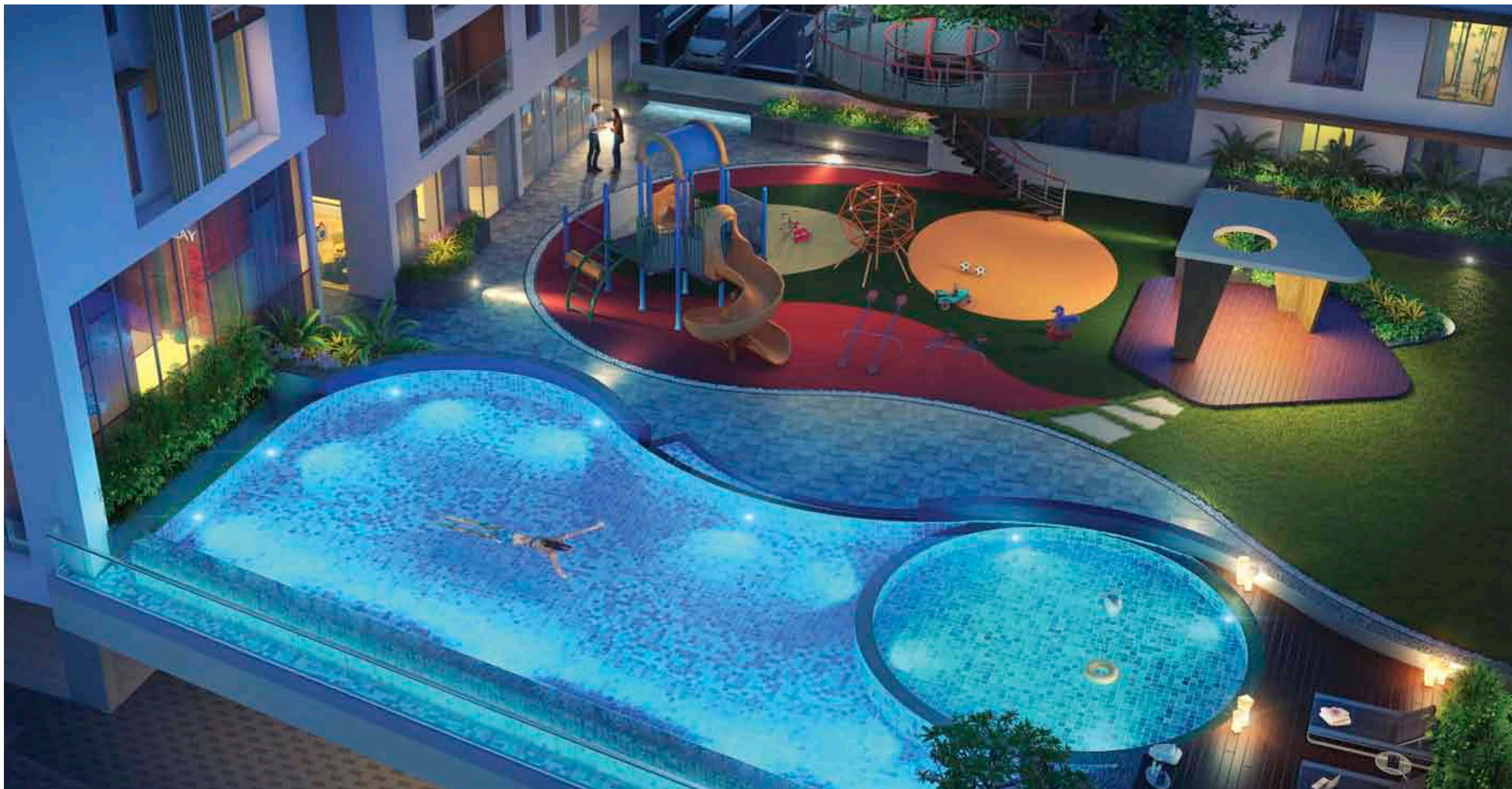
Infinity swimming pool