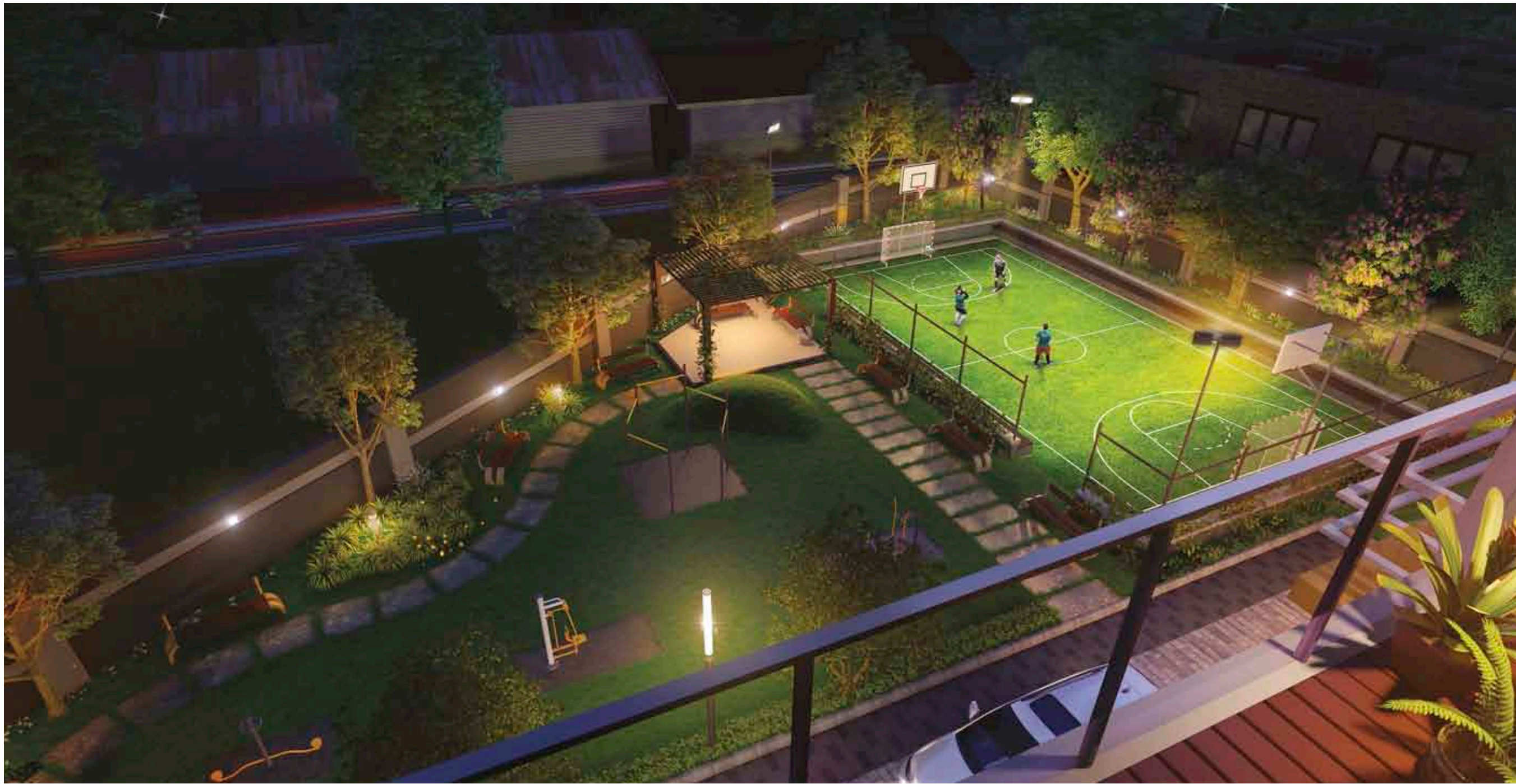
Multi-purpose sports arena