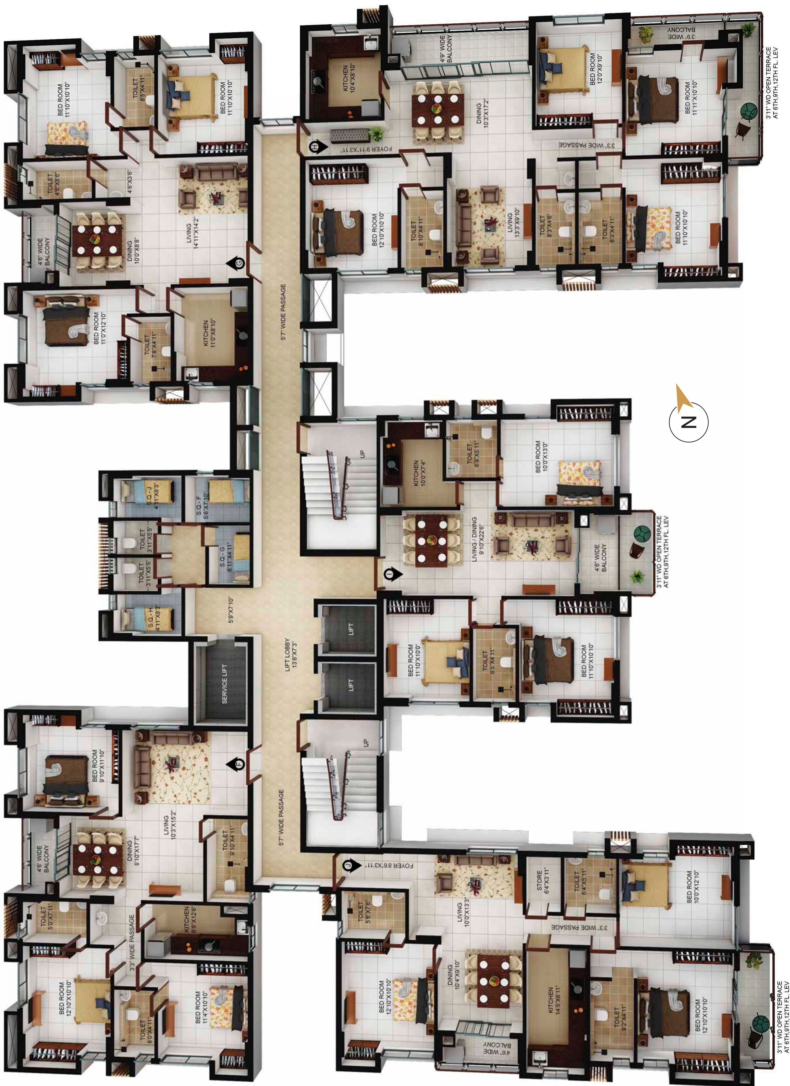
Tower-2 | Typical floor plan 6th, 9th & 12th floor (Area as per WBHIRA)