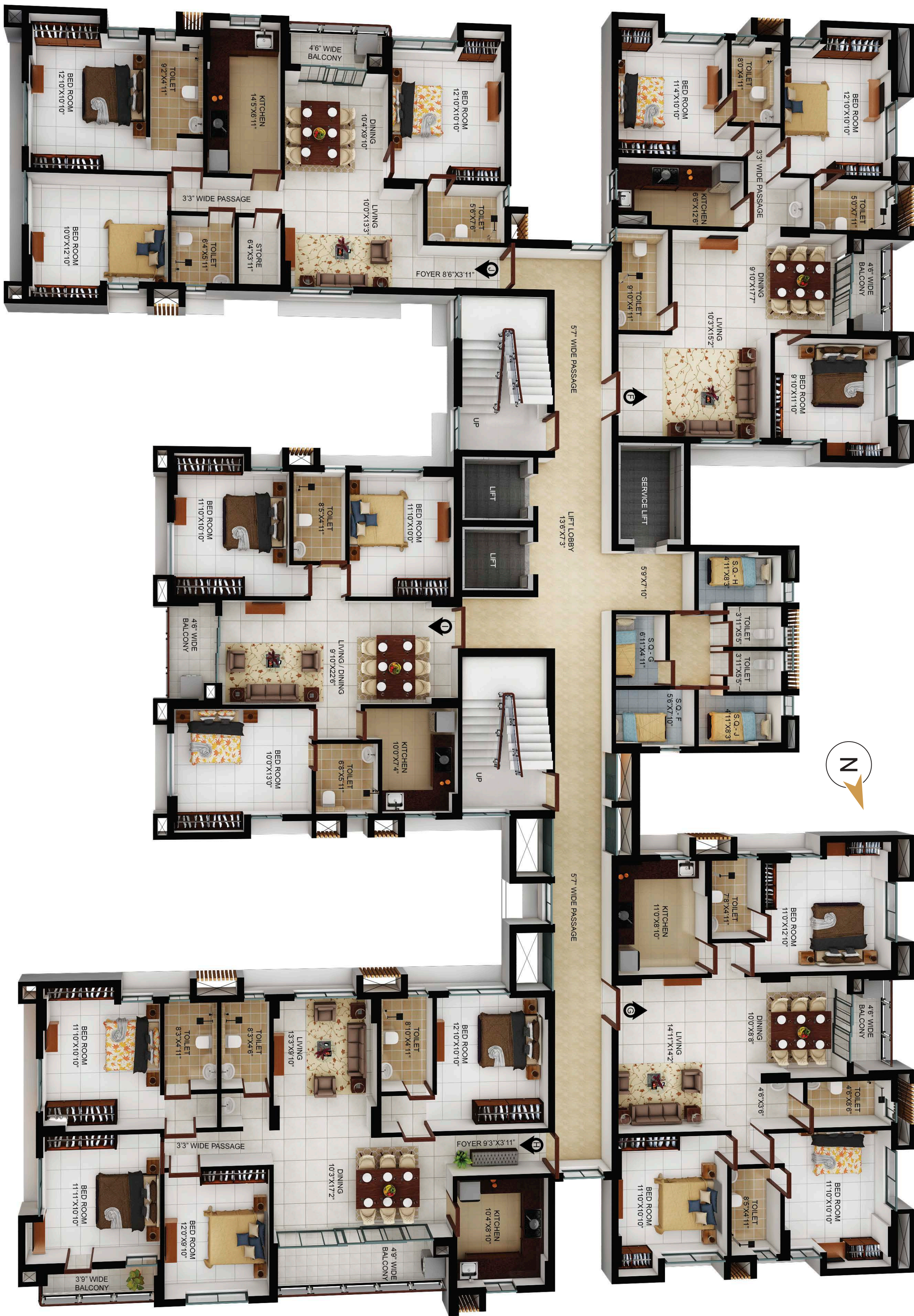
Tower-2 2nd & 3rd Typical floor plan (Area as per WBHIRA)