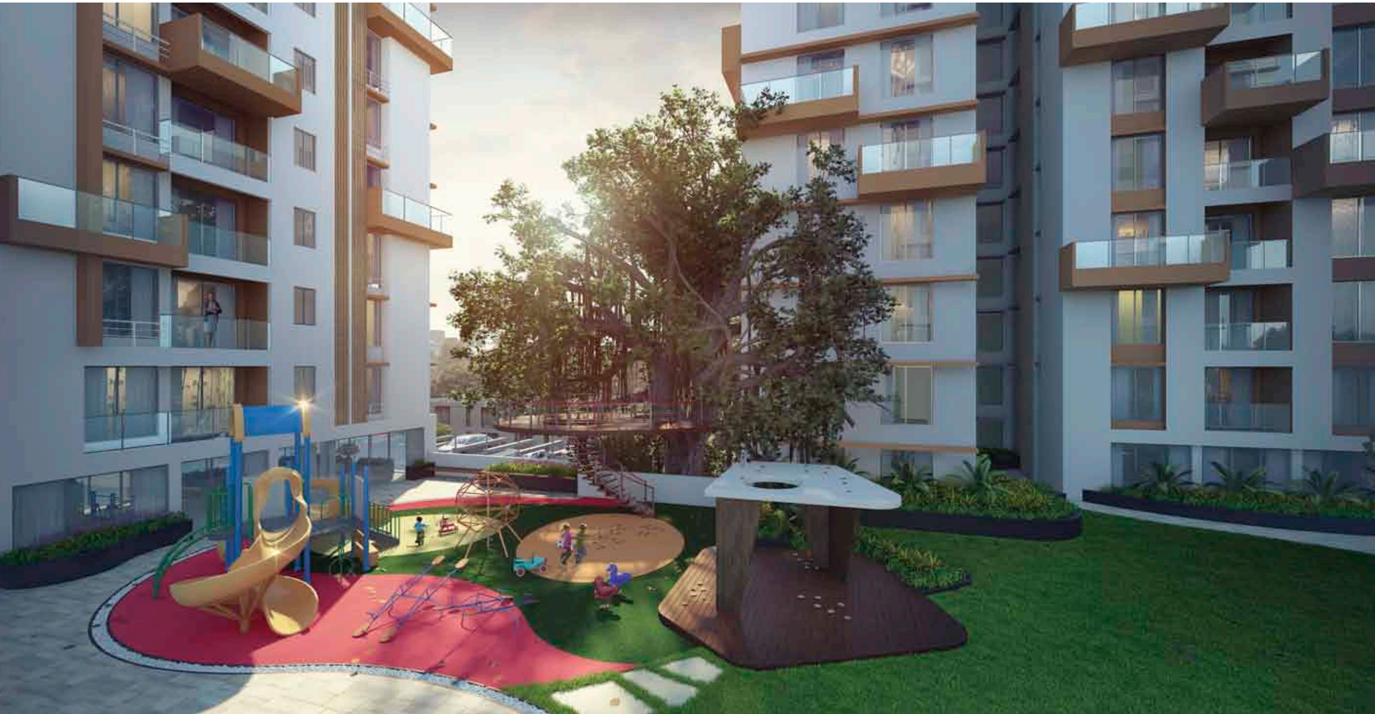
Central landscaped zone with Kid's play area