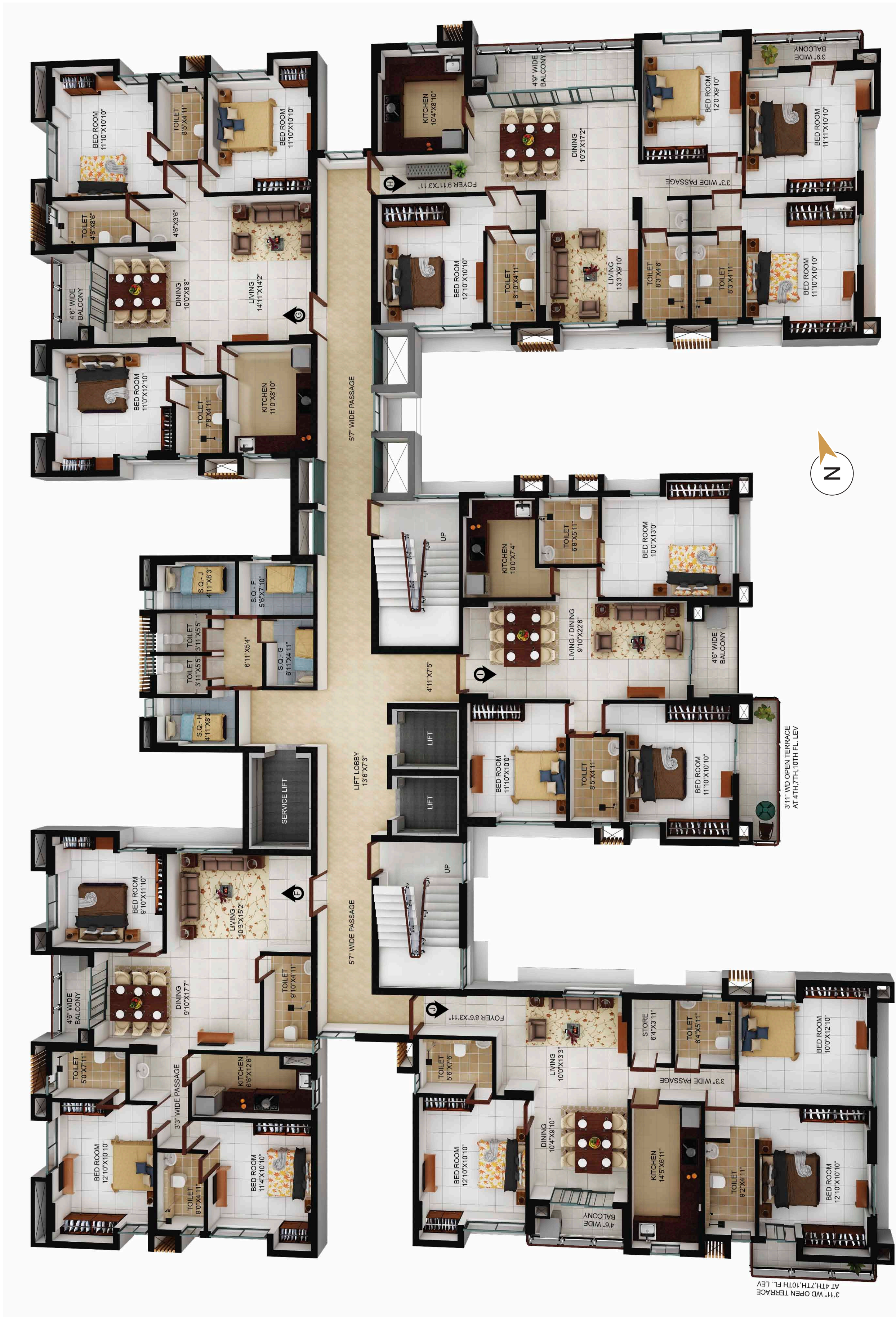
Tower-2 | Typical floor plan 4th, 7th & 10th floor (Area as per WBHIRA)