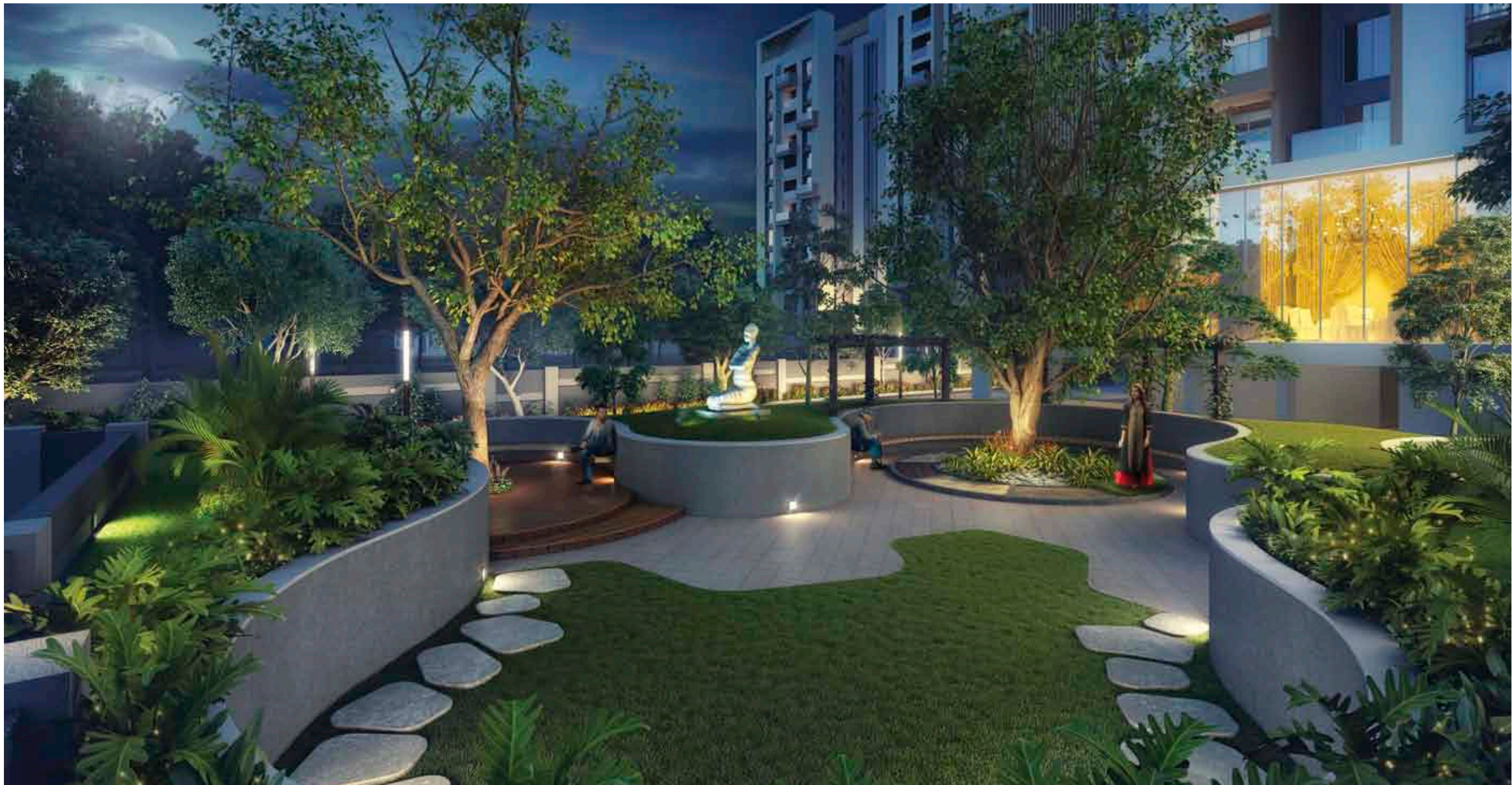
Therapy gardens with multi-experience sensory walk