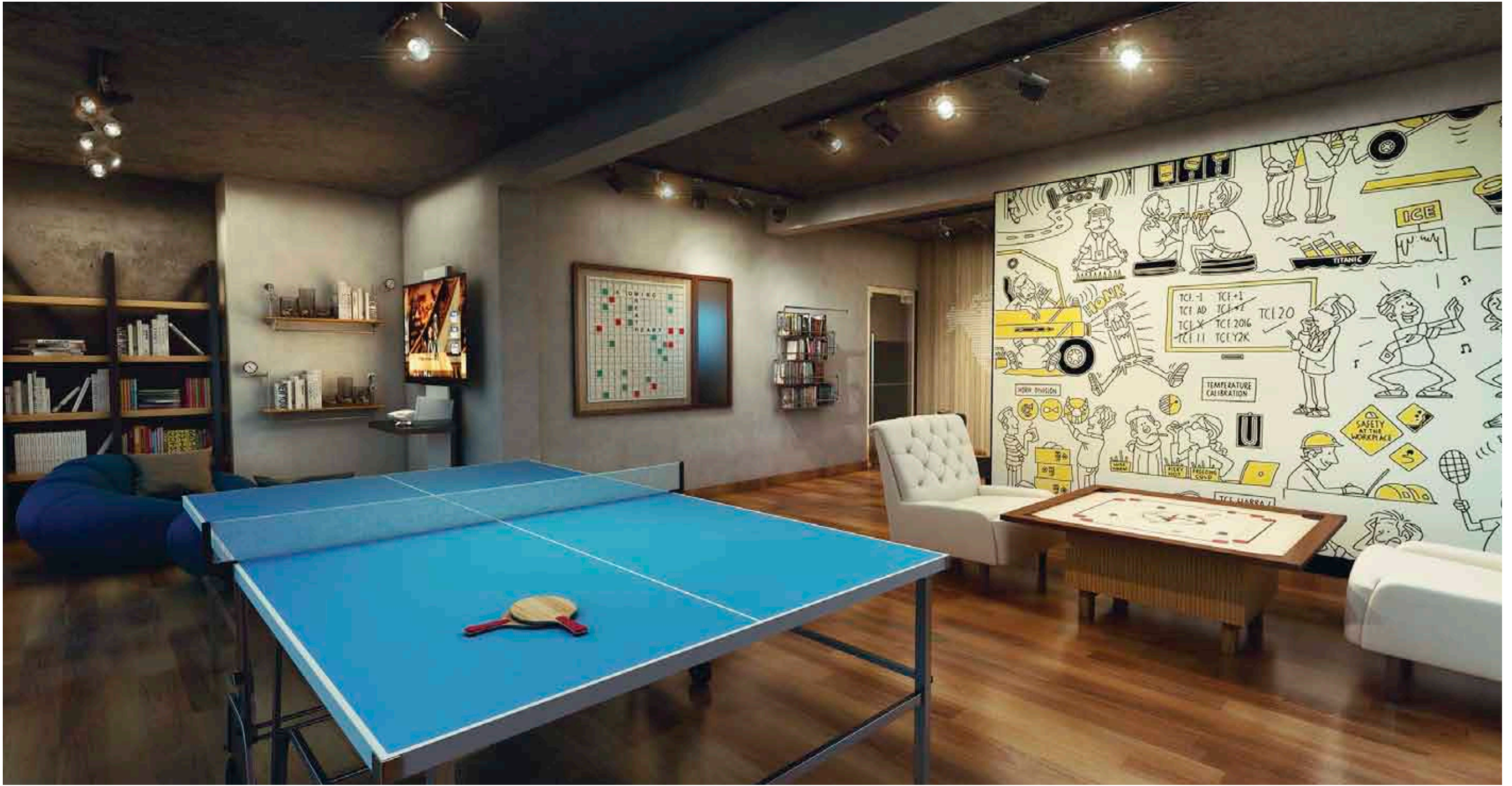
AC indoor games room