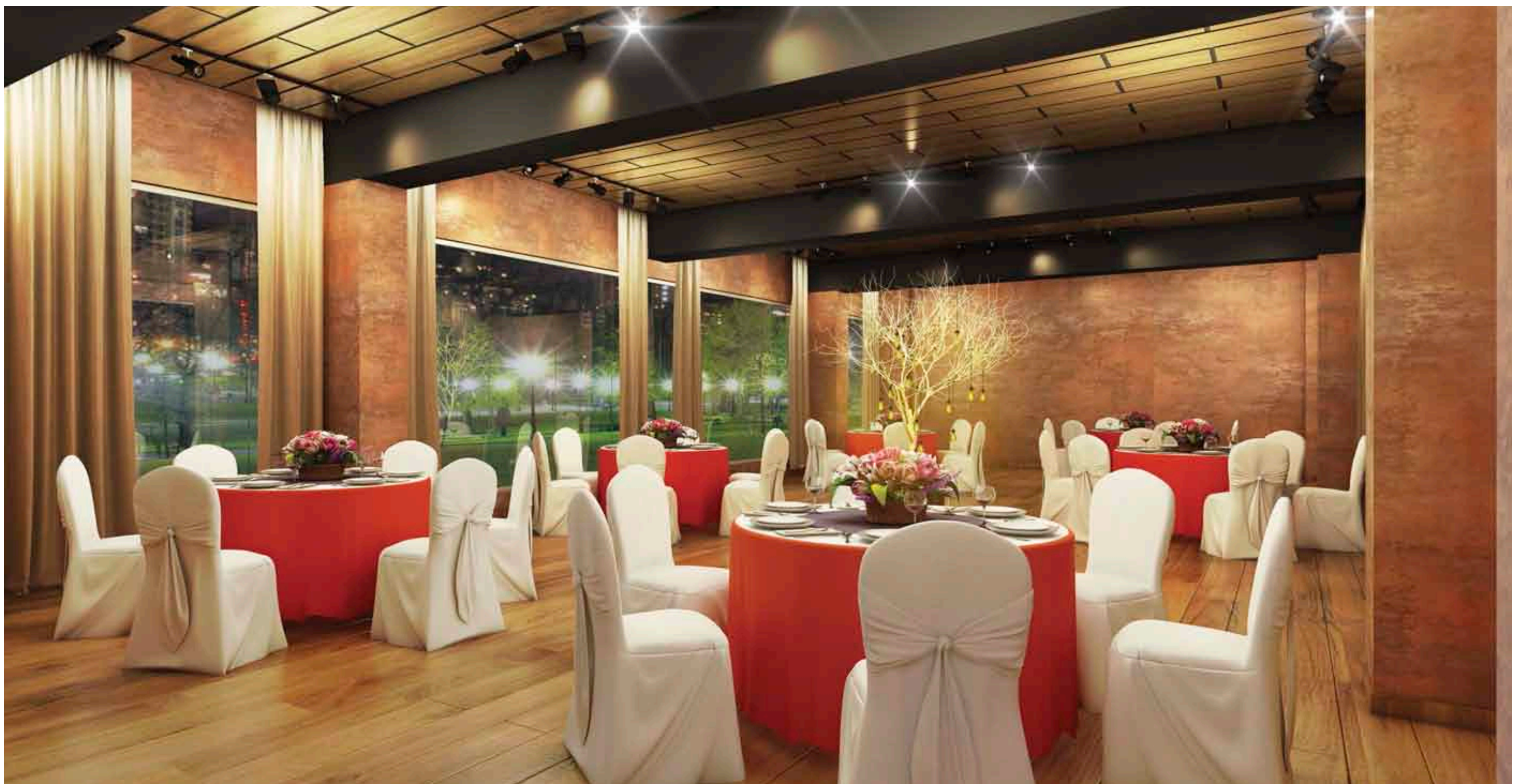
AC community hall